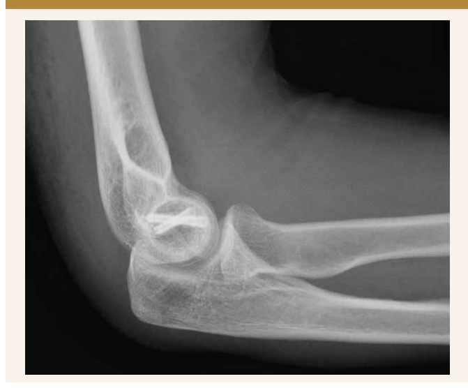
Figure 3 | Post-operative radiograph of the right elbow (lateral view) illustrating satisfactory reduction of the capitellar fragment with two intraosseous screws

entity, representing only 0.48 % of all AVN cases [12]. Significantly, all six patients had a history of corticosteroid use, however there was no relationship found between steroid dose and duration and the extent of AVN [12].