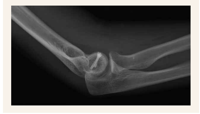
Figure 4 | Post-operative radiograph of the left elbow (lateral view) demonstrating two intraosseous screws providing reduction of the capitellar fragment