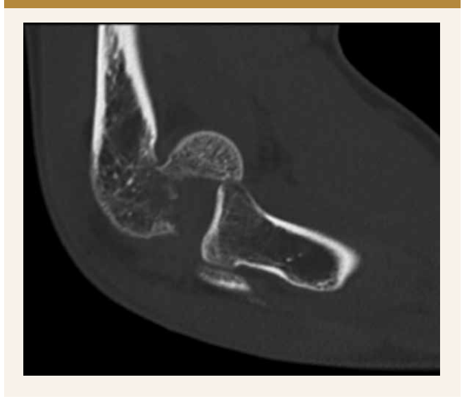
Figure 1 | Sagittal CT image of the right elbow demonstrating a type I capitellar fracture

with high dose oral steroids for suspected uveitis over a period of approximately four months preceding this presentation. This included doses of up to 50 milligrams (mg) of Prednisolone daily. The patient was otherwise well, took no other regular medications, and did not have a history of fracture. She was previously a light smoker, which she had only recently ceased, while her alcohol intake was not elicited.